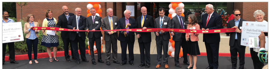
Partners and civic leaders celebrated the opening of the latest AL by ERS community, Maple Knoll Meadows, with a ribbon cutting.

Friendship Acres will open 114 apartments in 2021