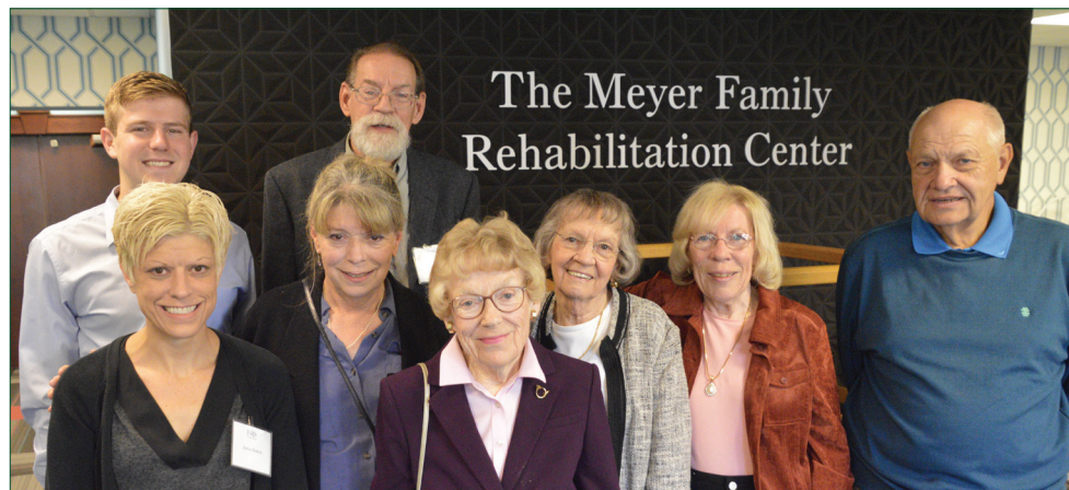
The opening of The Meyer Family Rehabilitation Center was celebrated by the family at a ribbon cutting and reception in October.