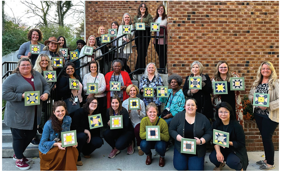
ERS Women in Leadership Affinity Group present their inspiring quilt pieces after their first in-person event at Madison Villa.

1,989 residents live in Affordable Living by ERS communities