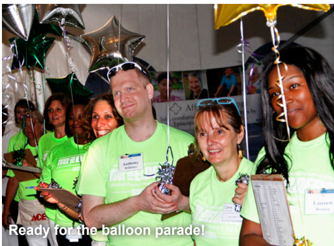
Ready for the balloon parade!