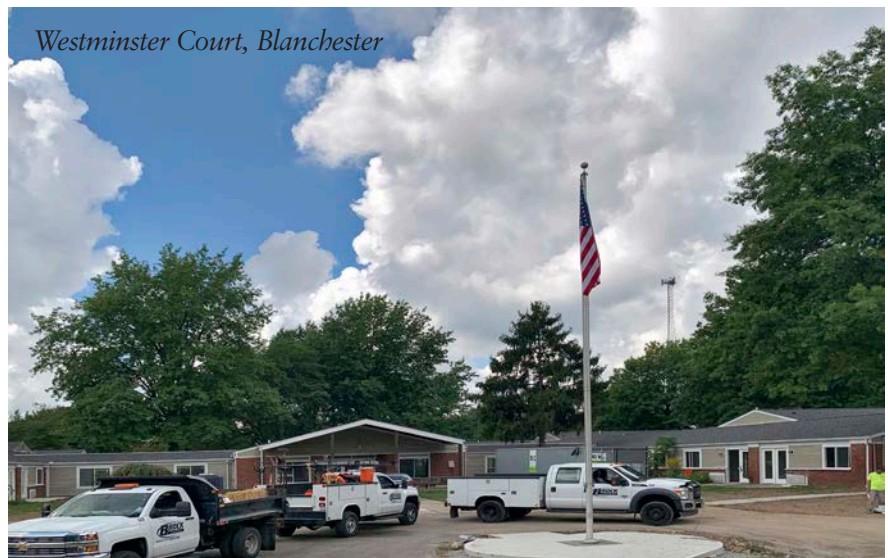
Westminster Court, Blanchester

Work is well underway at Westminster Court , despite a long process to secure the final funding for the development. An $8.5 million renovation of 64 one-bedroom apartments for low-income seniors involves renovating the community space and adding a kitchenette and fitness center with equipment customized for the needs of older adults. Senior-friendly fixtures, flooring, and lighting will be added to enhance the residents' ability to age in place, and the renovated community will meet Enterprise Green Communities criteria.