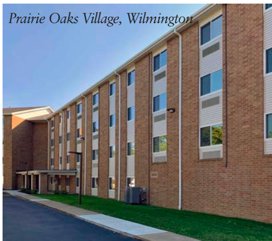
Prairie Oaks Village, Wilmington