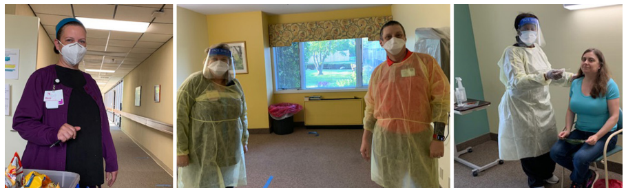
All ECH team members were tested at the ECH campus in June.

Not surprisingly, the ECH team has also displayed exceptional teamwork. Across the campus, team members are learning new skills and assuming new responsibilities to support each other and help protect the health and wellbeing of residents. Styling hair, offering assistance with COVID-19 testing, spending extra one-on-one time