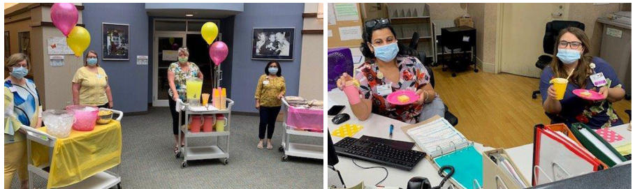
The Life Enrichment team served lemonade and lemon bars to everyone.

with residents, conducting temperature screenings, creating new and engaging activities within the confines of social distancing, sewing masks for coworkers, and countless other efforts have been contributed to keep our residents