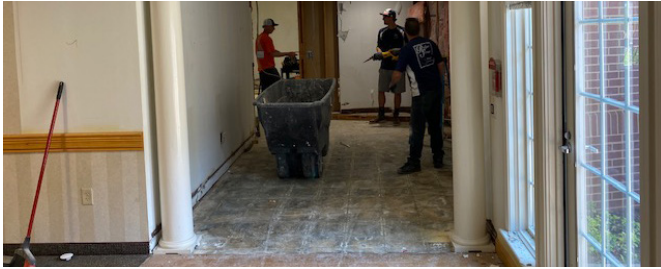
Demolition has begun in the Reed neighborhood.

More master plan updates will be shared as we make progress. To watch the May zoom call visit https://youtu.be/N48qZnvthQM