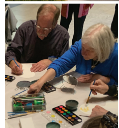
AT THE CONTEMPORARY ARTS CENTER